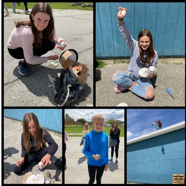
Grade 6 students from Mme. Sophie and Carolyn's class did the Egg drop challenge. 4 of the 6 survived!